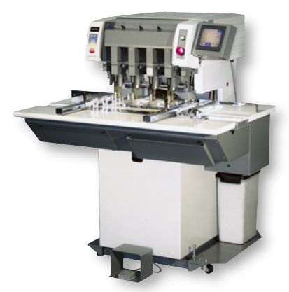
model SR-4X (Head distance: automatic setting) model SR-4Y (Head distance: automatic setting)